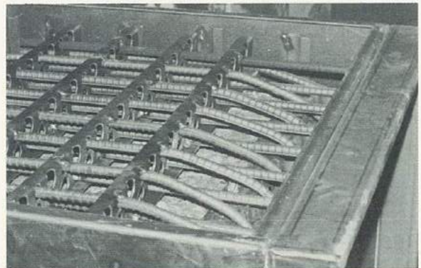
An impressive steel grid forms just one of the many lines of defense in the body build-up completely shrouding the main dense monolithic core of aluminum corund casting.

The INTERSEC Nordic Series is beautifully finished in a textured sand-grey with steel-blue fascia and polished chrome fittings.