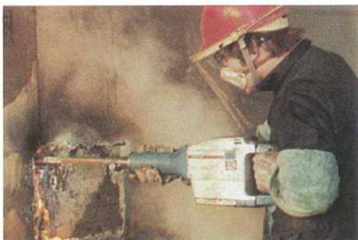
Built to withstand prolonged power-drilling and heavy tool techniques UL TL 30.