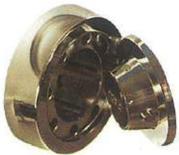
OPTIONAL ESCUTCHEON LOCK

Fittings Included in the price are standard fittings for every Treasury Safe, indicated in the dimensions table in this brochure. All shelves are adjustable. Please ask about the additional interior security features available as options.