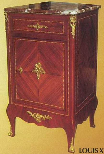
LOUIS XV 65