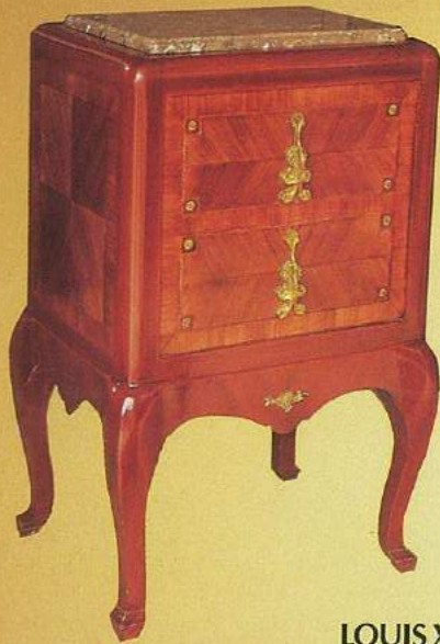
LOUIS XV 38