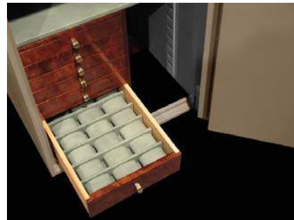
All models (except AV1212 & AV1512) are sized to accept our standard jewelry and watch drawer systems

Empire Safe Company, Inc., the leading supplier of safes and vault rooms to the world's finest jewelers and retailers, has created this selection of high quality burglary protection safes at affordable pricing. Commercial level security features make this an appropriate choice for the protection of valuables. Compact and streamline in design, many models fit conveniently into closets and alcoves, under tables and desks, and in other locations with limited space.