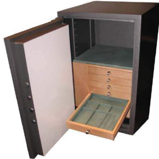
Model AV2416 with left swing door plus optional 6-drawer interior and cover shelf