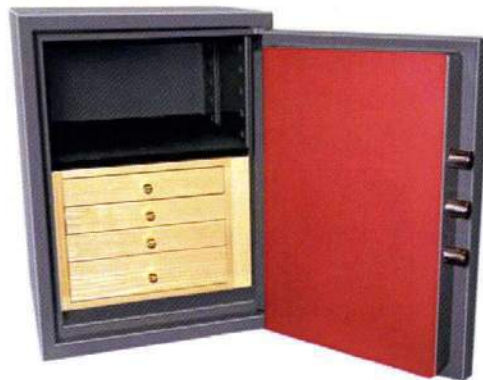
Model AV1814 with optional 4-drawer interior and cover shelf

Custom Interiors Available With Jewelry & Watch Drawers (inquire within for complete details)