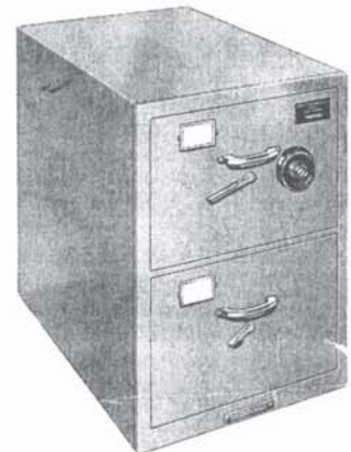
ITEM NO. 7110-976-4850

Contract No. GS-DOS-80860 Model 22-68 Serial No. [REDACTED] Date of Manufacture - 1969/70 Manufactured by: DIEBOLD INCORPORATED