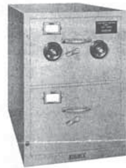
Dual Control Two-Drawer Model