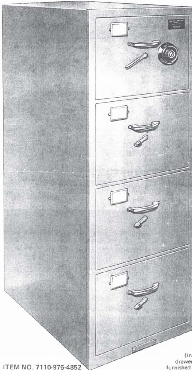
ITEM NO. 7110-976-4852