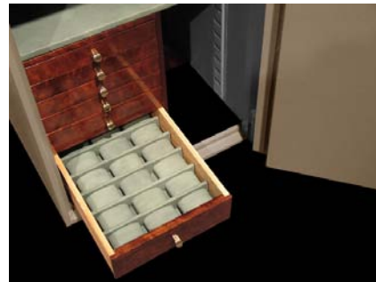
All models (except AV1212 & AV1512) are sized to accept our standard jewelry and watch drawer systems

Empire Safe Company, Inc., the leading supplier of safes and vault rooms to the world's finest jewelers and retailers, has created this selection of high quality burglary protection safes at affordable pricing. Commercial level security features make this an appropriate choice for the protection of valuables. Compact and streamline in design, many models fit conveniently into closets and alcoves, under tables and desks, and in other locations with limited space.