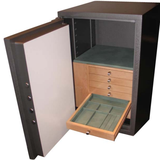
Model AV2416 with left swing door plus optional 6-drawer interior and cover shelf