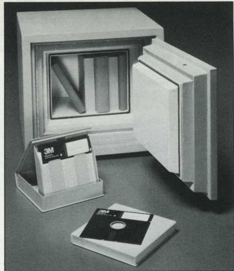
3M is a trademark of Minnesota Mining and Manufacturing

Should your MVP-101 be exposed to fire, contact your dealer regarding our special replacement program.